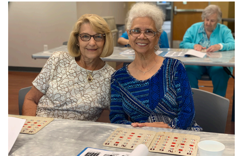
Lunch and Bingo