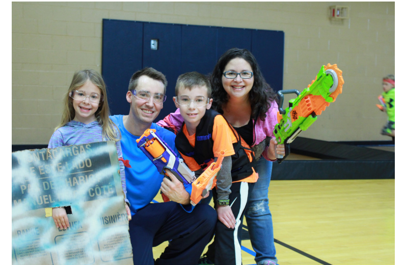
Family Nerf War