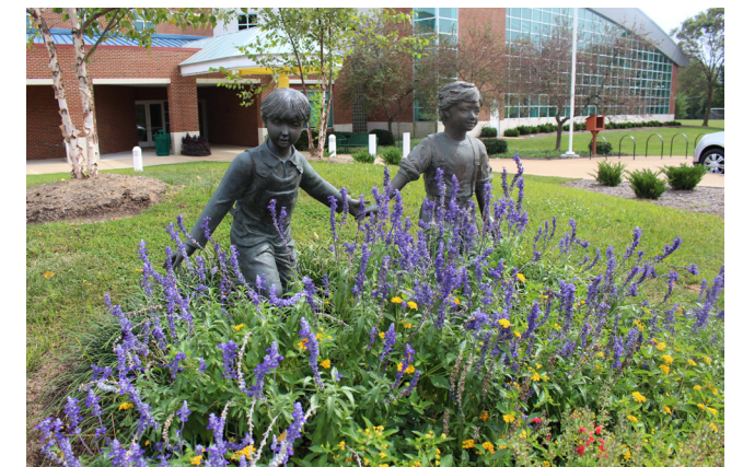
6 Location: The Pointe at Ballwin Commons Year Installed: 2006