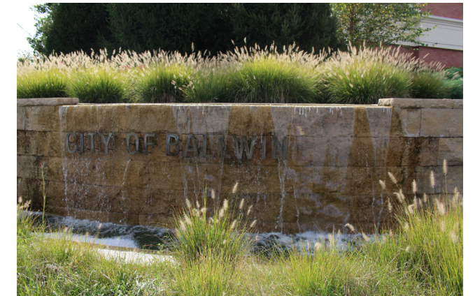
4 Location: Kehrs Mill Road and Clarkson Road Year Installed: 2012