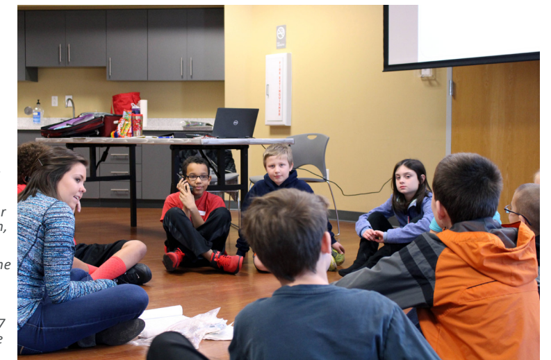
Basics of Staying Home Alone

For a complete and updated list of City events and meetings please visit www.ballwin.mo.us and select the events tab.