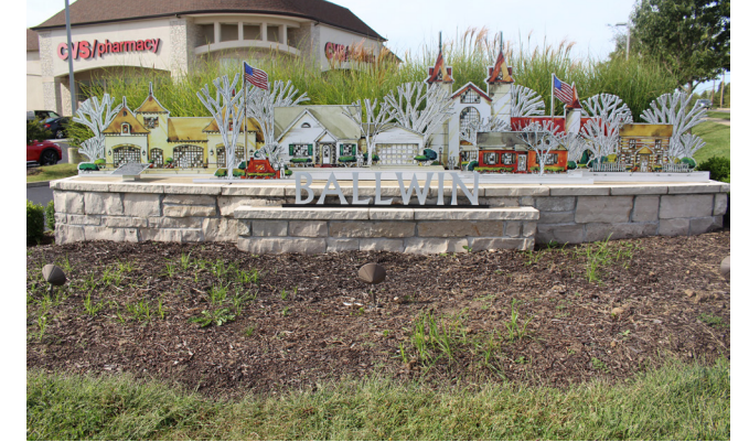
2 Location: Clayton Road and Henry Avenue Year Installed: 2010