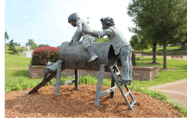
1 Location: Vlasis Park Year Installed: 2019