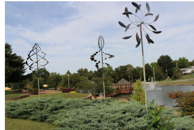
3 Location: Vlasis Park Year Installed: 2006