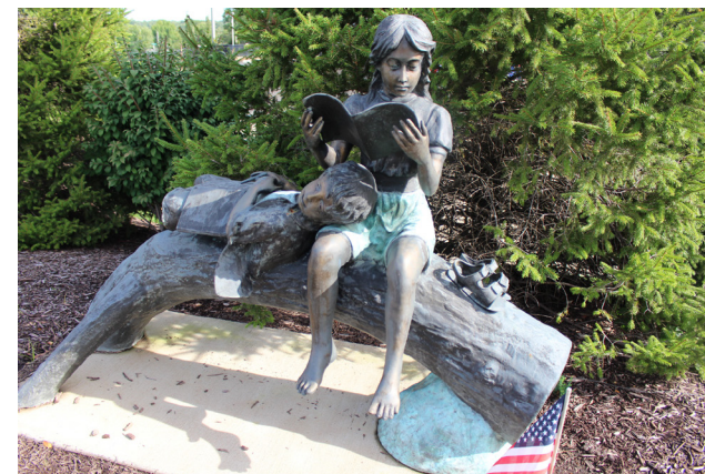
5 Location: Manchester Road and Seven Trails Drive Year Installed: 2014