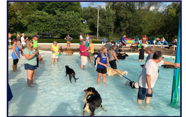
Photo: 2019 Dog Swim