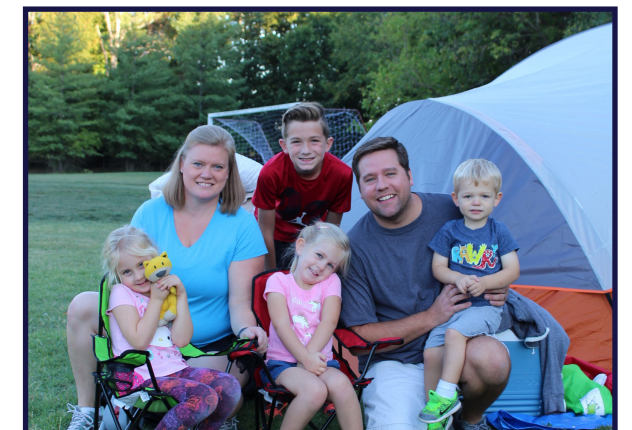
Photo: 2017 Family Campout

For a complete and updated list of City events and meetings please visit ballwin.mo.us and select the events tab.