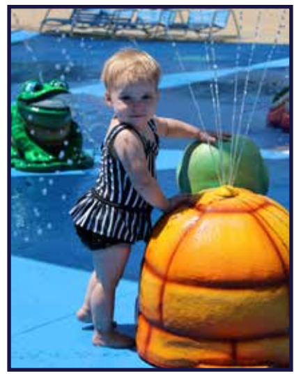
North Pointe Opening Day, May 25, 2024