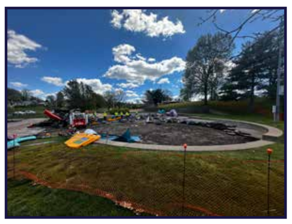
Vlasis Park Playground Construction 2024