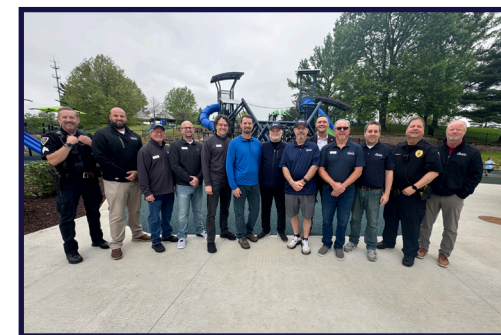
Vlasis Park Ribbon Cutting, April 2025

Please note, all meetings are subject to change. Visit our website for the most current information.