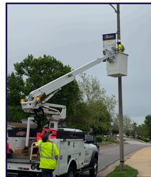
Public Works Crews Installing Banner Winners