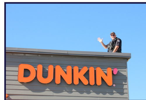
Cop on a Rooftop, May 2025