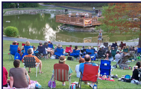
Photo of 2012 Concert in the Park