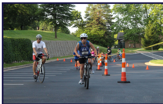
Photo of 2016 Ballwin Triathlon