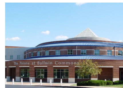
The Pointe at Ballwin Commons