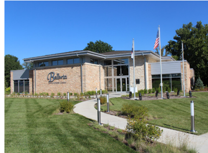
Ballwin Government Center