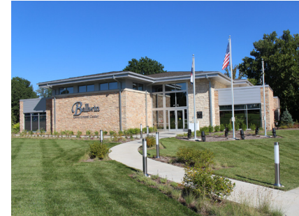
Ballwin Government Center

Area Services Aging Ahead (636) 207-0847 Animal Control (St. Louis County) (314) 726-6655 Better Business Bureau (314) 645-3300 Castlewood State Park (636) 227-4433 County Library (several branches) (314) 994-3300 DMV Drivers Testing Station (636) 256-3951 Earthbound Recycling (636) 938-1188 Employment Office (314) 340-4950 IRS (314) 612-4002 Missouri Highway Patrol (314) 340-4000 Saint Louis Household Hazardous Waste Drop-Off Facility (314) 615-8989 Social Security Administration 1 (800) 772-1213 St. Louis County (314) 615-5000 USPS (636) 227-5783 West County Chamber of Commerce (636) 230-9900 West County License Office (636) 230-5041 Wildlife Rescue Center (636) 394-1880