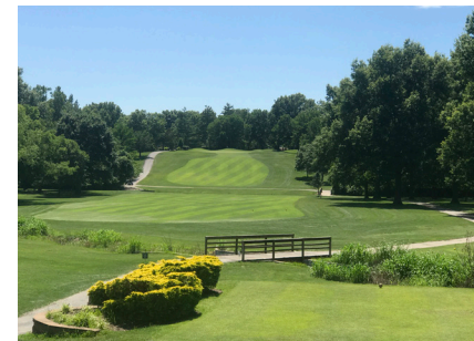
Ballwin Golf Course