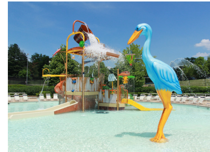
North Pointe Aquatic Center