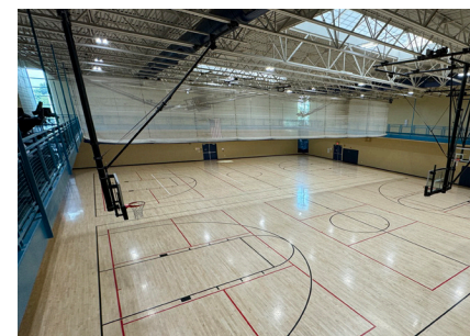
The Pointe at Ballwin Commons