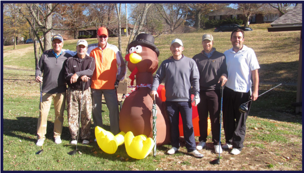
Photo: 2018 Turkey Bowl 18-Hole Scramble