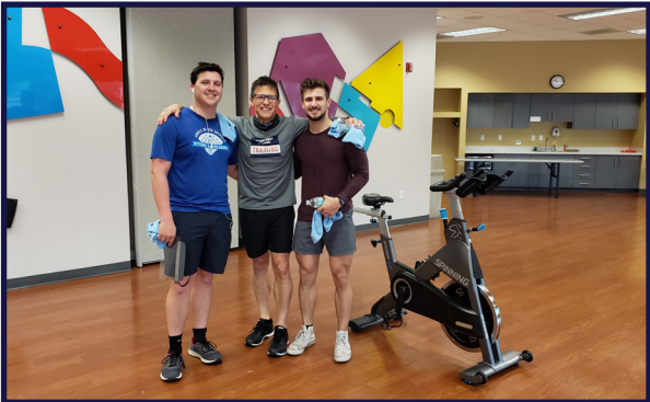
Photo: 2021 Upside Down Indoor Triathlon

For a complete and updated list of City events and meetings please visit www.ballwin.mo.us and select the events tab.