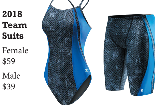
Johnny Mac's online team store coming soon!